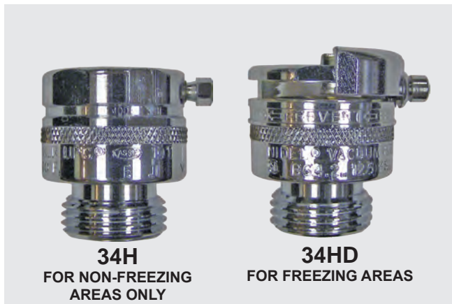
34H FOR NON-FREEZING AREAS ONLY